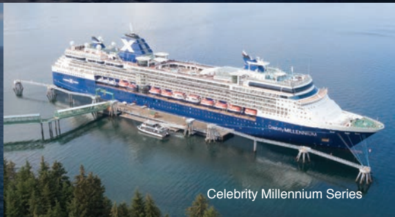
Celebrity Millennium Series