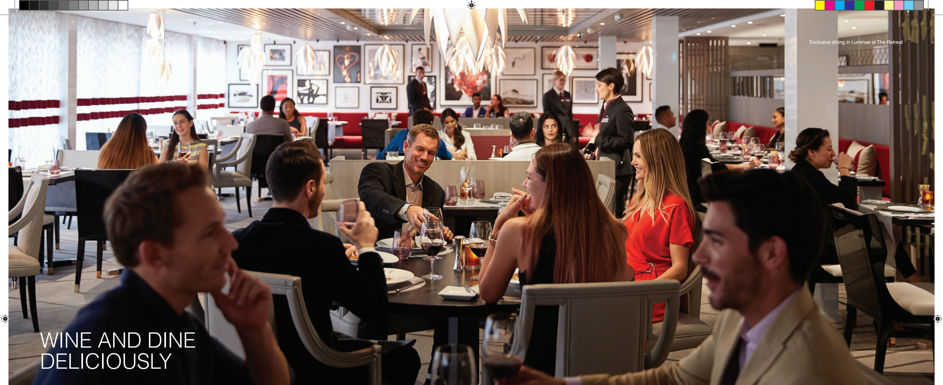
Exclusive dining in Luminae at The Retreat