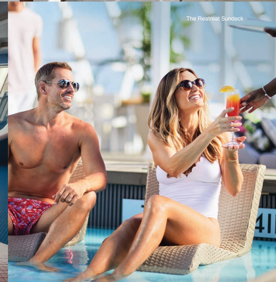
The Retreat Sundeck