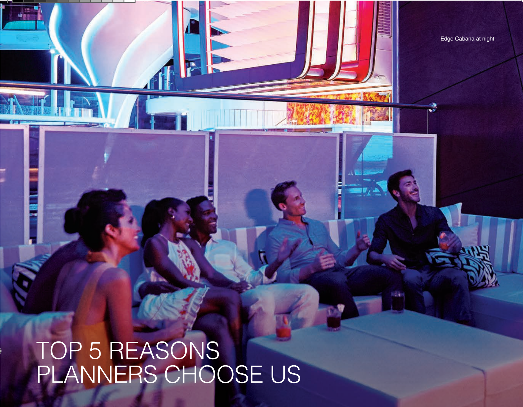
Edge Cabana at night