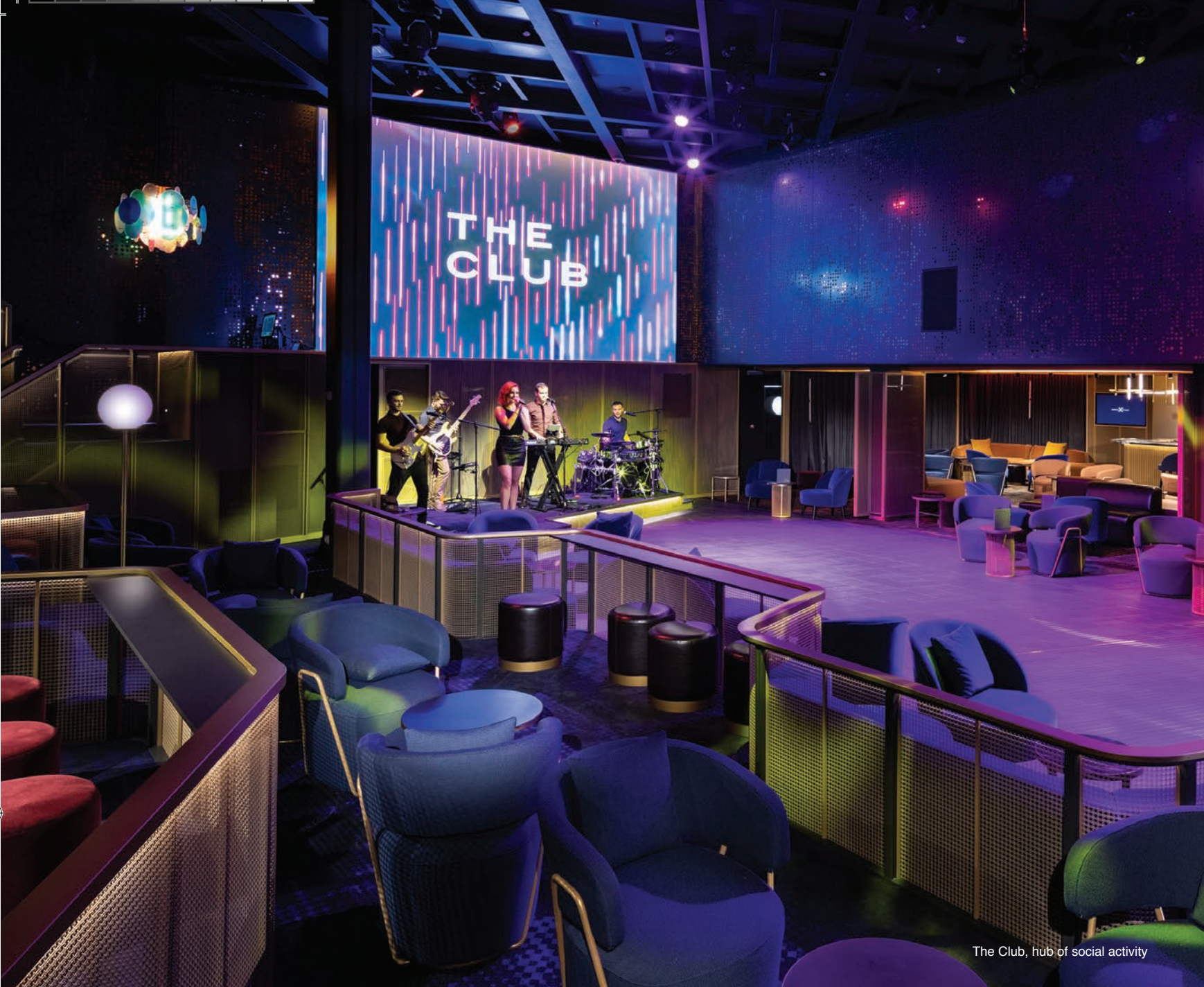
The Club, hub of social activity