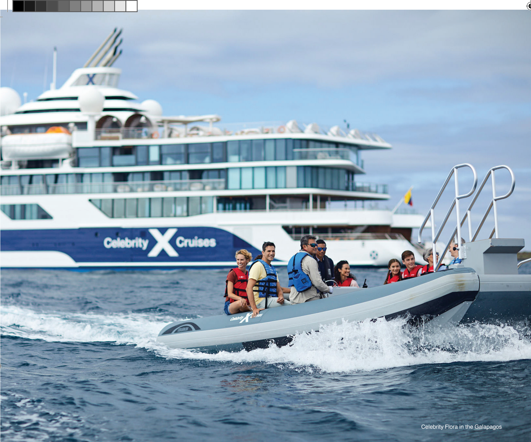
Celebrity Flora in the Galapagos