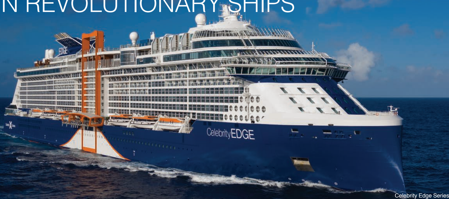
Celebrity Edge Series