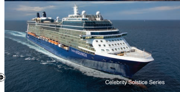
Celebrity Solstice Series