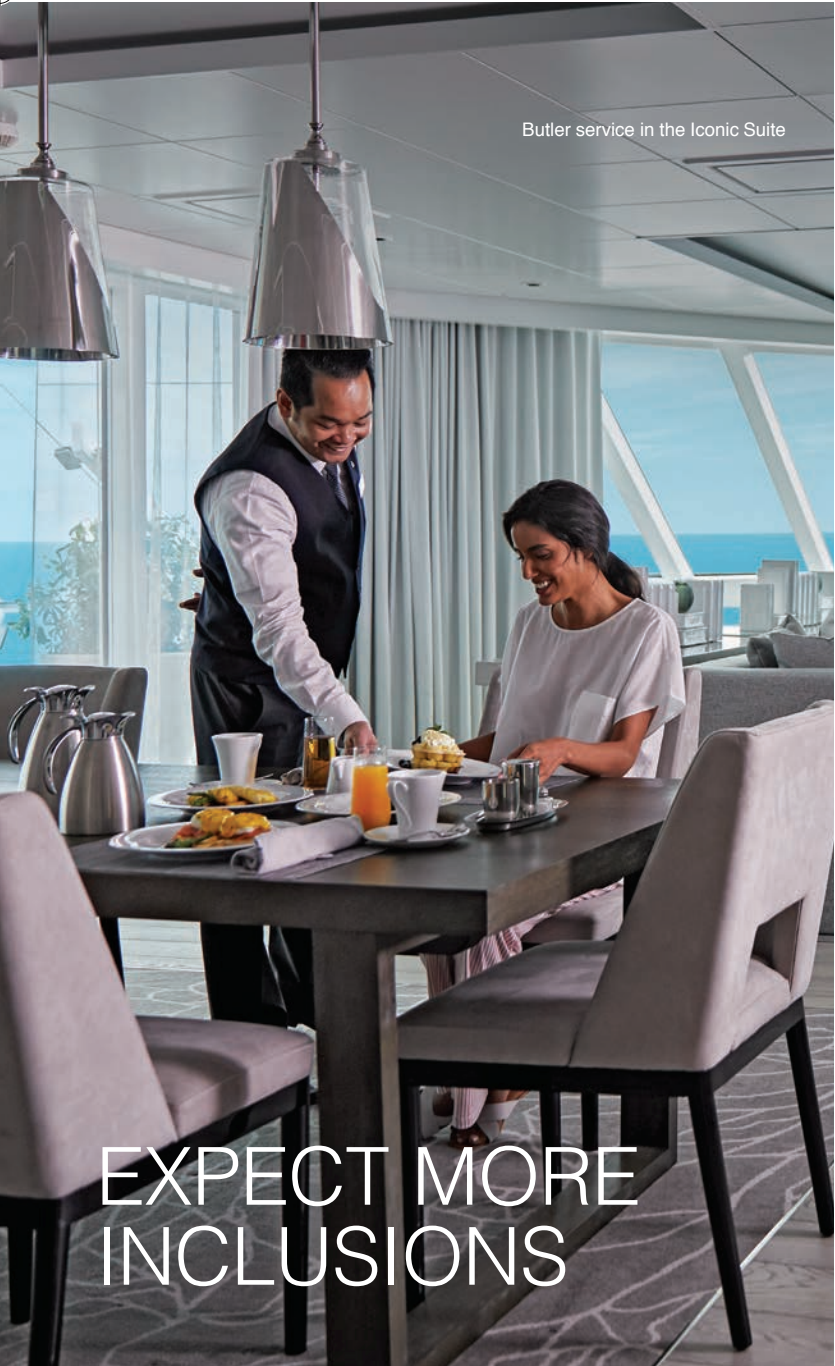
Butler service in the Iconic Suite