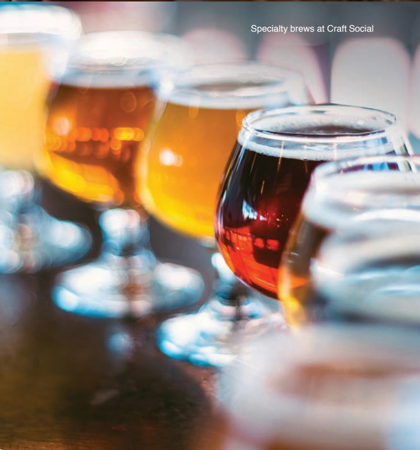
Specialty brews at Craft Social

barbecue overlooking half an acre of real grass; and other dining spots found nowhere else on Earth. Wine. In every restaurant, dishes get paired perfectly from our extensive wine list—more than 400 labels on board—with guidance by expert sommeliers. In fact, we dominate the Wine Spectator Restaurant Wine List awards, and we’re the only cruise-line winner of the prestigious Award of Excellence. Drinks. No one ever goes thirsty on our sailings. The ships feature bars and lounges for every mood, from the ever-popular Martini Bar to the new Rooftop Terrace, where guests can enjoy movies under the stars with cocktails and snacks. Can we bring you anything else?