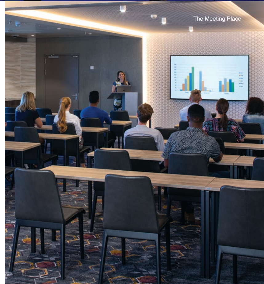
The Meeting Place

With us, the world is truly at your service.